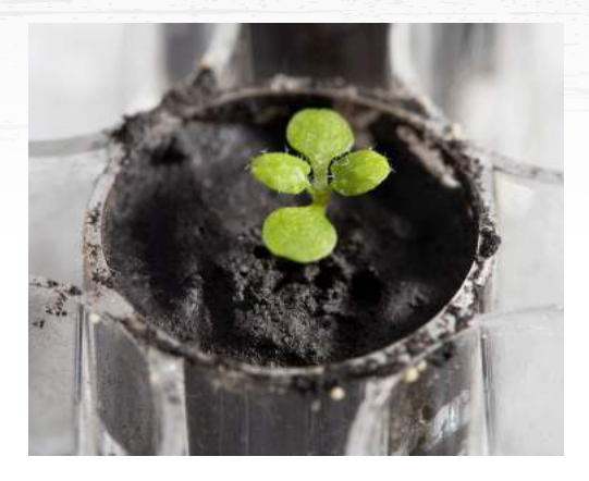
UF/IFAS scientists were the first to grow plants in soil from the Moon.

Expenditures signal the effort toward discovery and innovation to deliver solutions to Florida's challenges. For the fourth consecutive year, our #1 national ranking from the National Science Foundation (NSF) in ag, natural resources and conservation research expenditures is a metric that shows UF/IFAS is working hard for the benefit of our state.