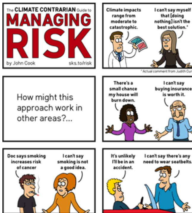
Cartoon provided by Skeptical Science